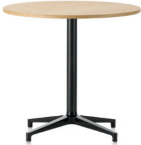
Bistro Table, Round table, indoor