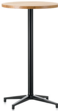
Bistro Table stand-up table, Round table,