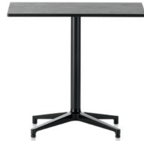
Bistro Table, rectangular table, indoor

The Bistro Tables were conceived in connection with the Softshell Chair and reiterate the shape of its elegant cruciform base. Due to its simple form, the table can be combined with a wide variety of chairs; the version with a solid-core laminate top is also suited for outdoor use. The Bistro Tables are available in both sitting and standing heights.