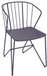
7101 - ARMCHAIR Solid steel sheet seat Steel tube and rod base and backrest