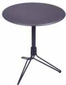
7110 - PEDESTAL TABLE Ø 67 CM Sheet steel table top Steel tube and rod base