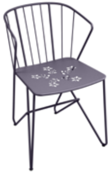
7100 - PERFORATED ARMCHAIR Laser-cut solid steel sheet seat Steel tube and rod base and backrest